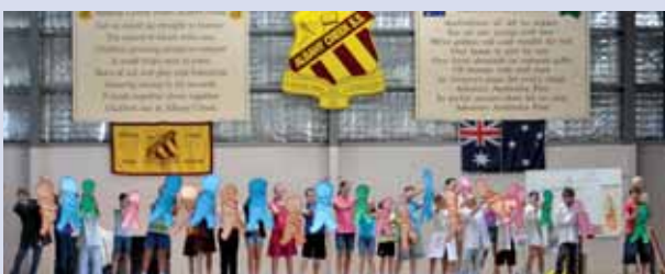
Albany Creek State School year 6 students promote Jelly Baby week to raise funds for the Juvenile Diabetes Research Foundation.