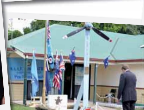
RAAF Association Pine Rivers Branch 548 & 549 Squadrons Memorial Service 2010 at Tarakan House Murrumba Downs.